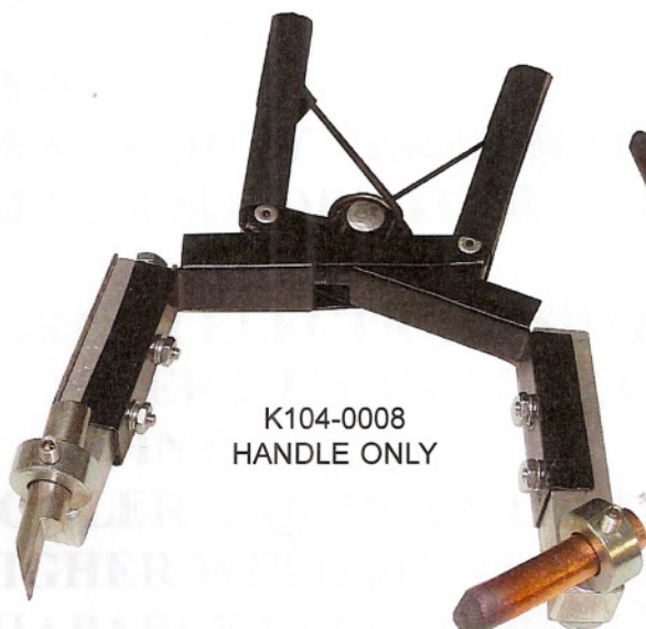
K104-0008 HANDLE ONLY